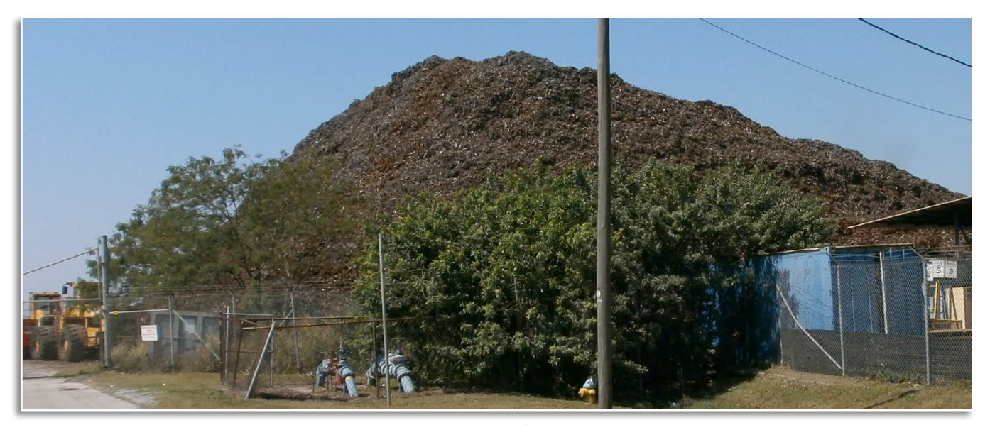
32,000 metric tons of iron and steel