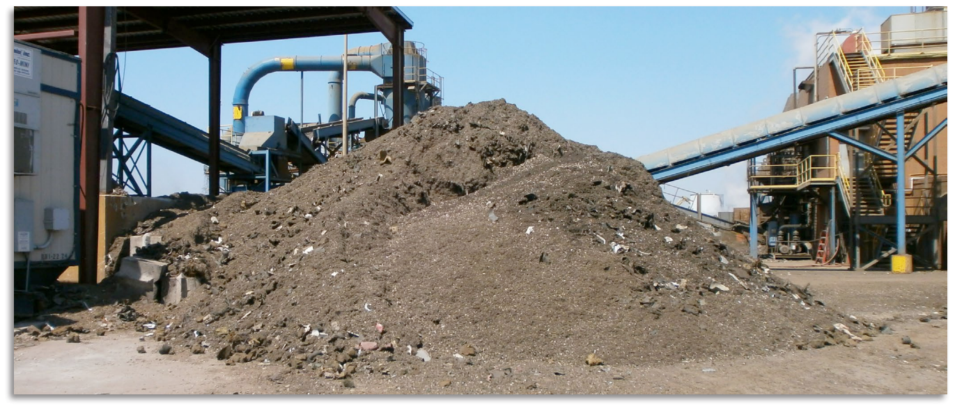
"Fluff" (seats, fabric, plastic, and a little bit of metal!)